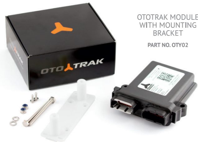
OTOTRAK MODULE WITH MOUNTING BRACKET PART NO. OTY02